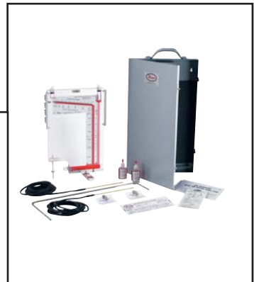
Complete Kit, Model 400-10

Left — Model No. 400-5 Air Meter, 0-5" W.C., 400-9000 f.p.m.